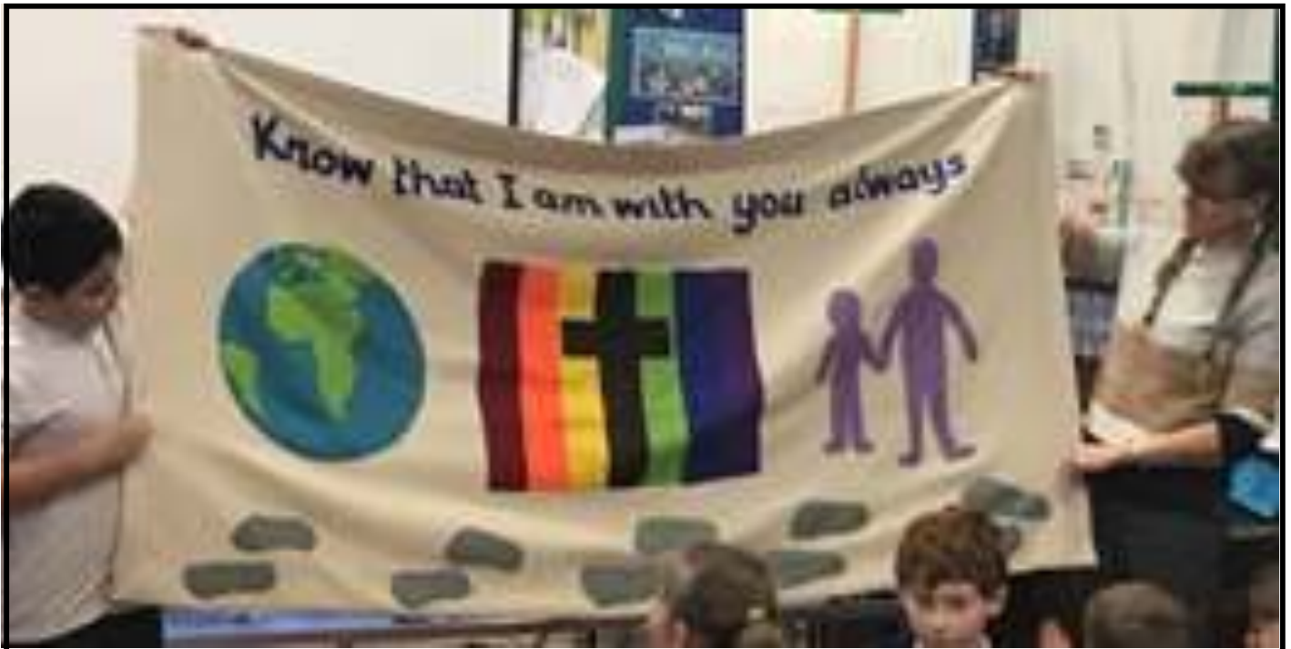
ST. MARY'S CHURCH ALTAR CLOTH - see School News opposite