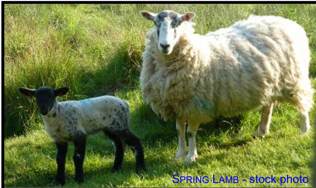
SPRING LAMB - stock photo