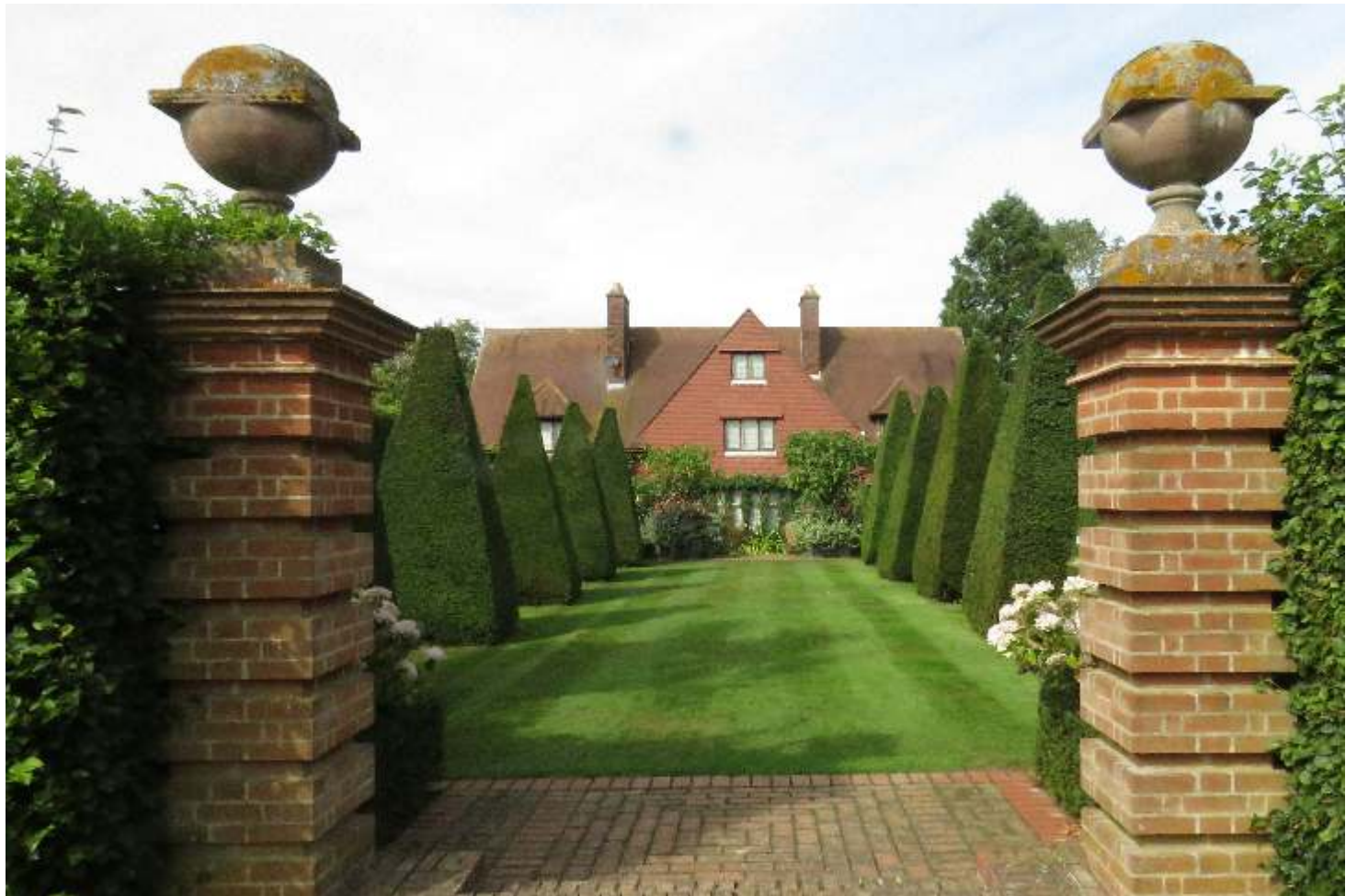
Gardens at The Old Vicarage, East Ruston Horticultural Society trip - see page 22.