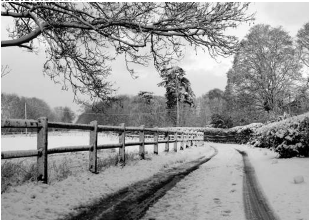
Grove road in winter - stock photo provided by Bob Mawkes