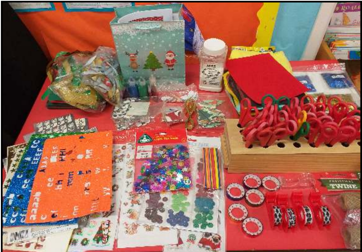
Making goody bags - School photo