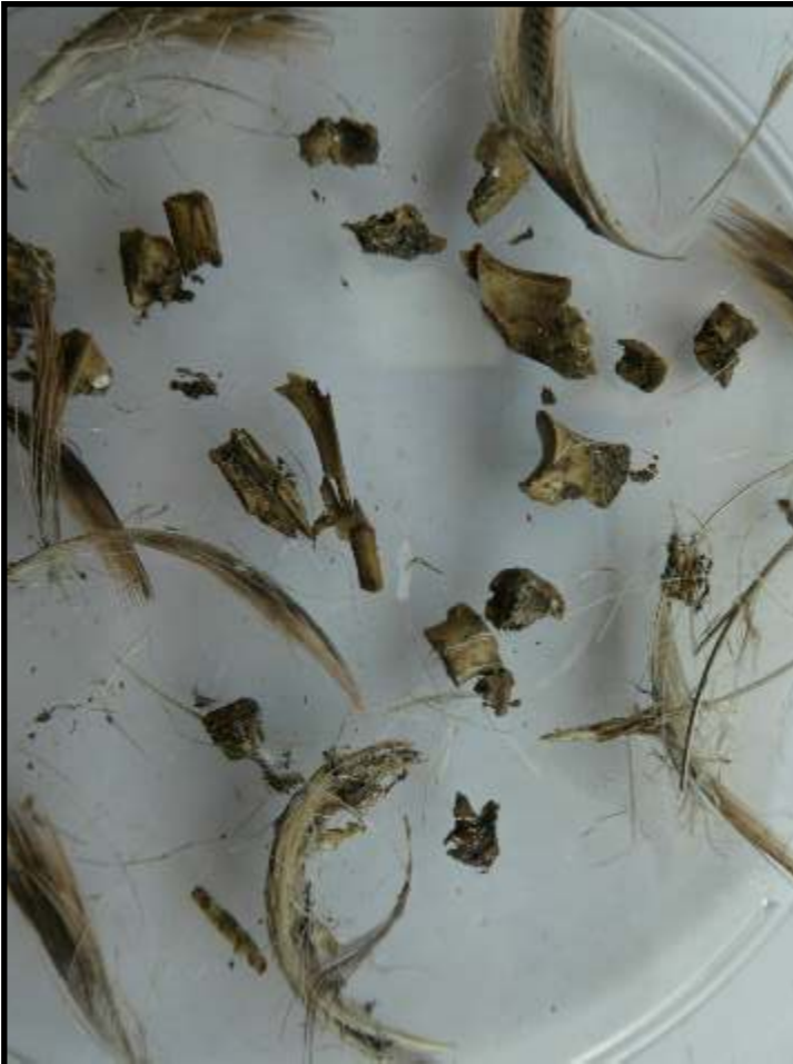
Sample of the Otter Spraint Contents