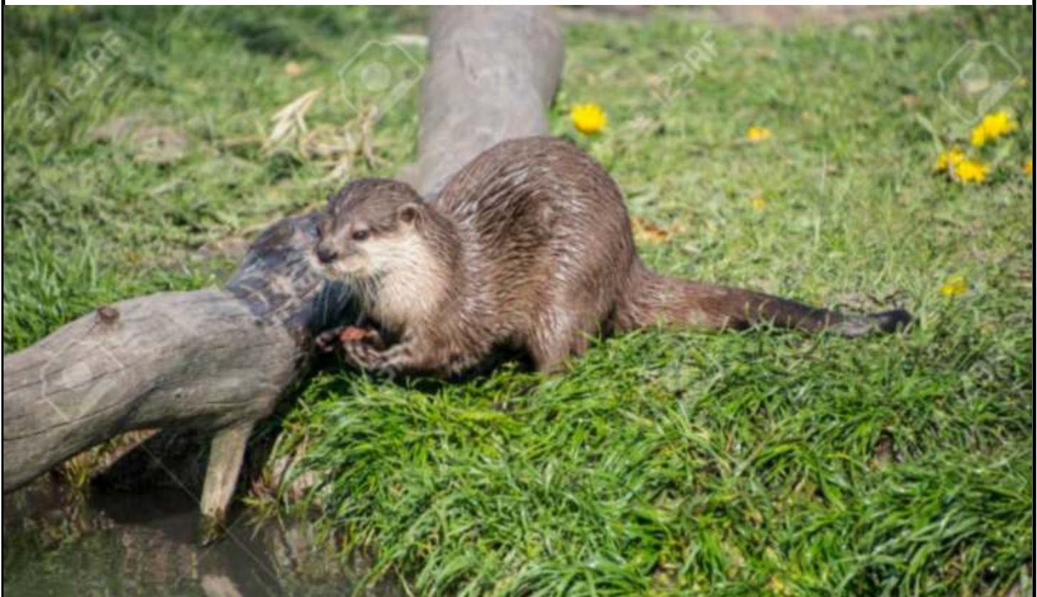
European Otter ( Lutra Lutra )