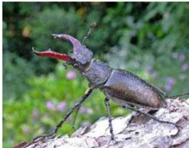
Male Stag Beetle