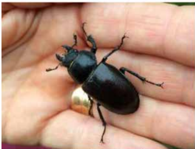
Female Stag Beetle