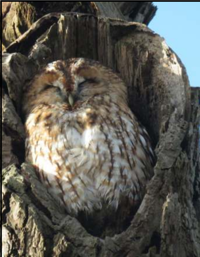
Tawny Owl