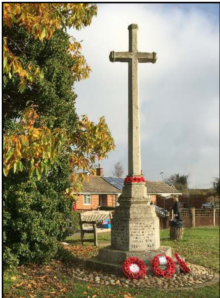
Remembrance. See article on page 7