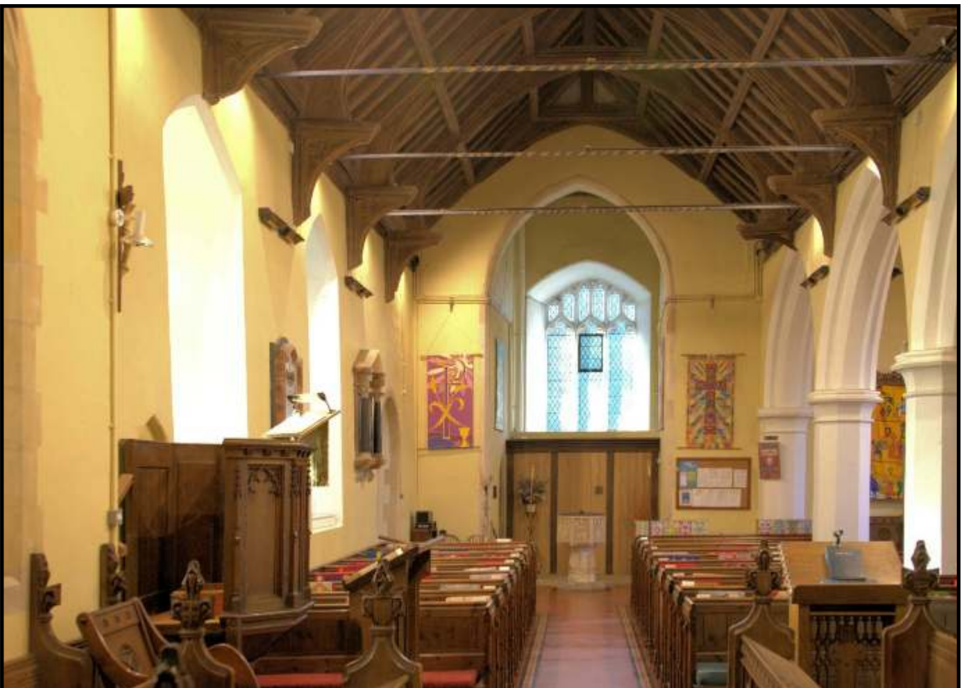
View West towards Tower which houses new toilet