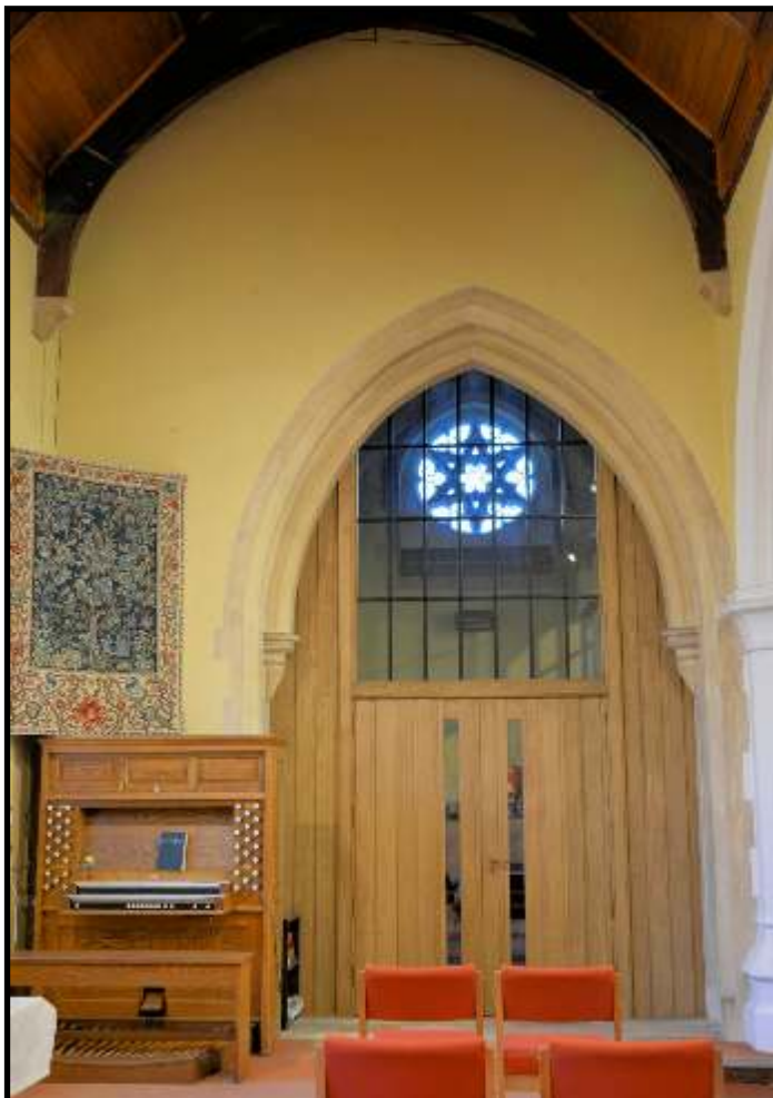
New Church Organ & oak screen entrance to new kitchen/meeting room