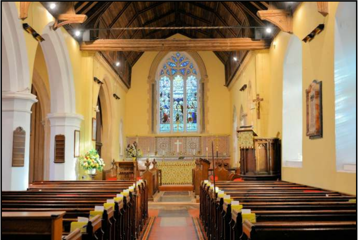
View from font towards large East window