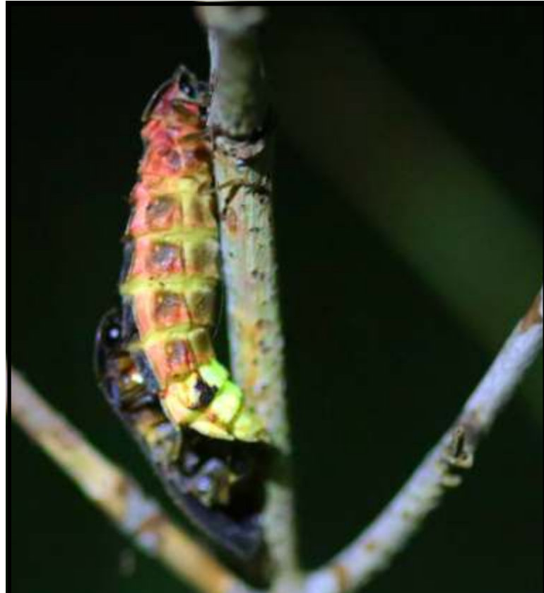
Mating Glow Worms at Pipers Vale See article on page 16 opposite