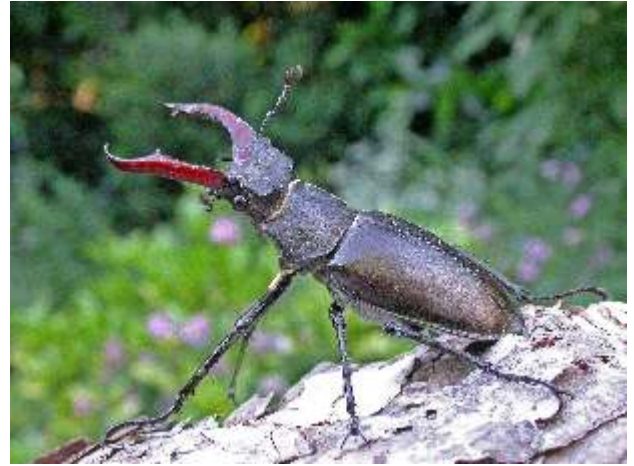
Male Stag Beetle