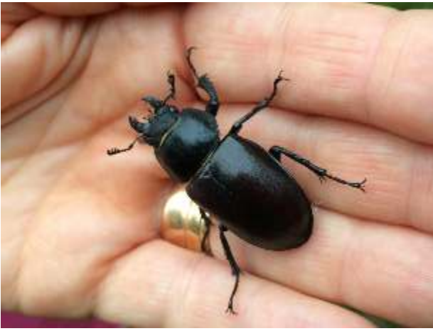
Female Stag Beetle