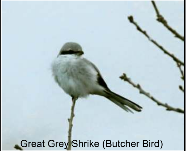
Great Grey Shrike (Butcher Bird)