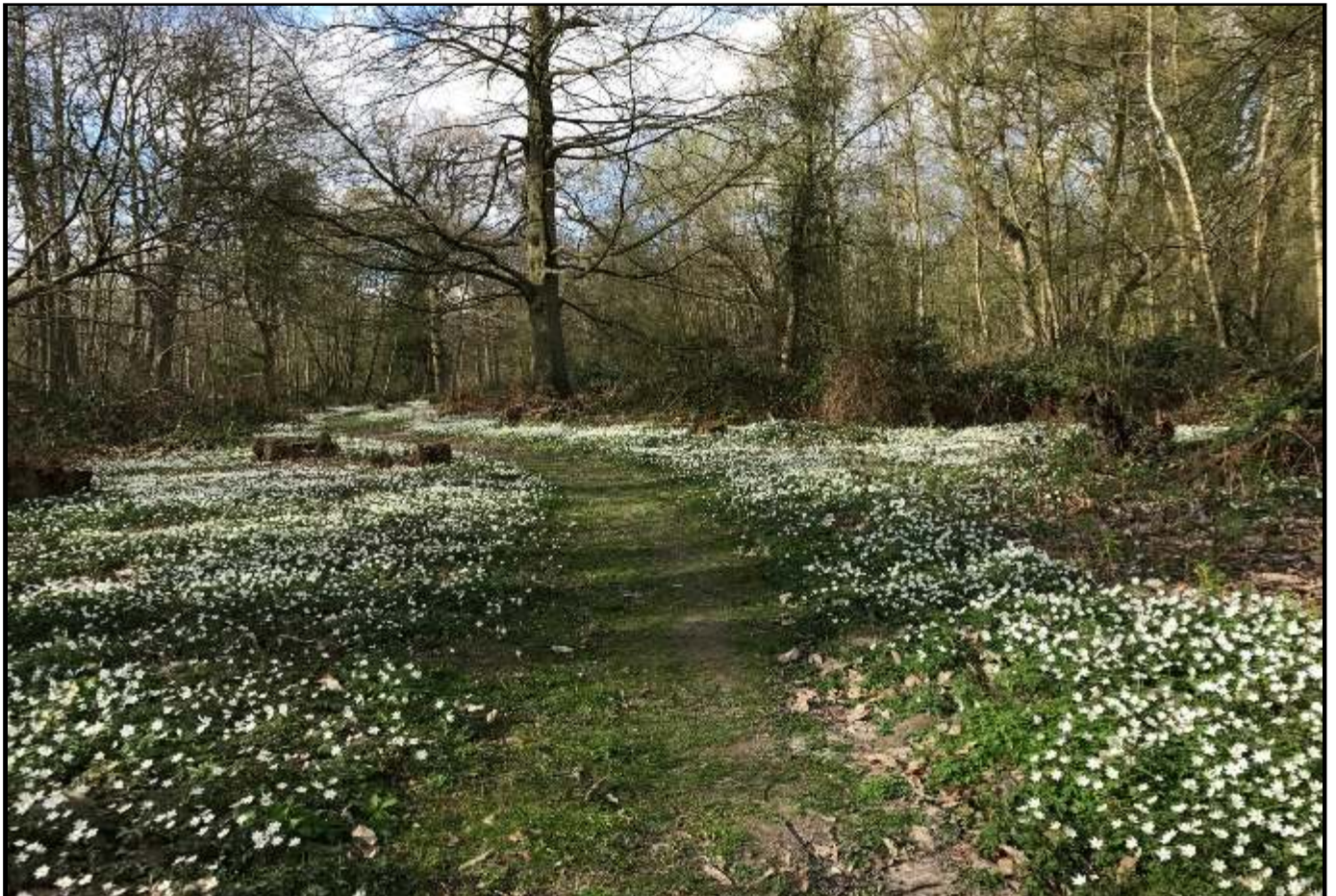
A Walk Among the Anemones - Photo Dorna Owen

Colin Hawes (lead for the conservation of stag beetles in Suffolk)